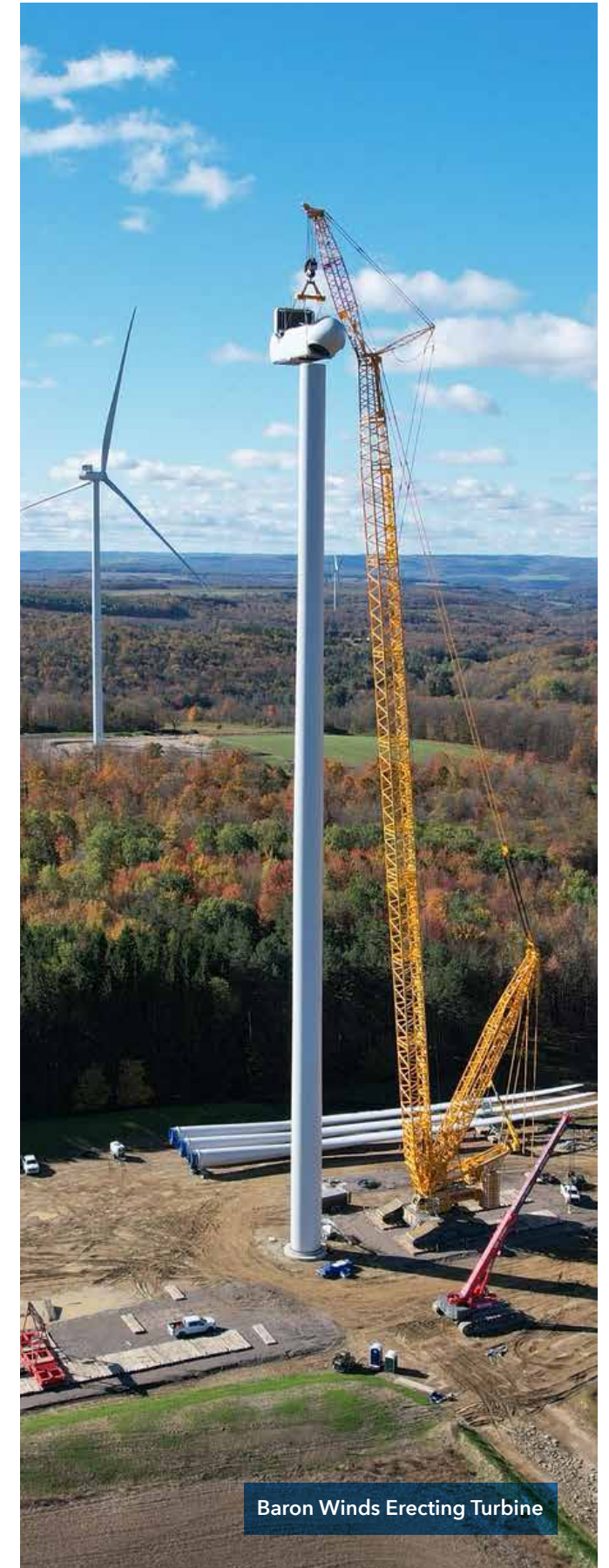
Baron Winds Erecting Turbine

In July, Momentum Environmental marked the grand opening of its new non-hazardous waste processing facility in the Town of Bath. As a vertically integrated provider of environmental and industrial services, Momentum Environmental is dedicated to minimizing landfill waste by efficiently separating materials for recycling. This project was made possible with support from the IDA, underscoring the agency's commitment to advancing sustainable development in the region.