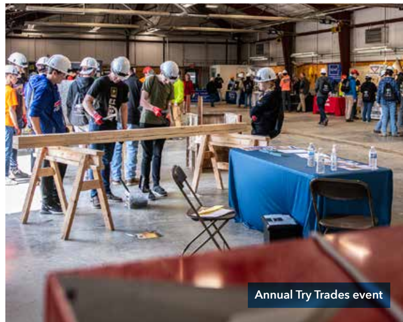
Annual Try Trades event

Supporting our existing businesses remained a central focus in 2025. We hosted small business roundtable discussions, collaborated with REDEC to expand lending programs for downtown investments, and saw the annual Try Trades event continue to grow, introducing more students to promising careers in the trades.