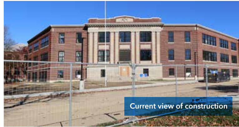
Current view of construction

These transformative projects are currently under review by state officials, with final award announcements expected in early 2026. The collaborative planning and investment efforts undertaken in 2025 have set the stage for meaningful, long-term improvements that will benefit Bath's residents, businesses, and visitors.