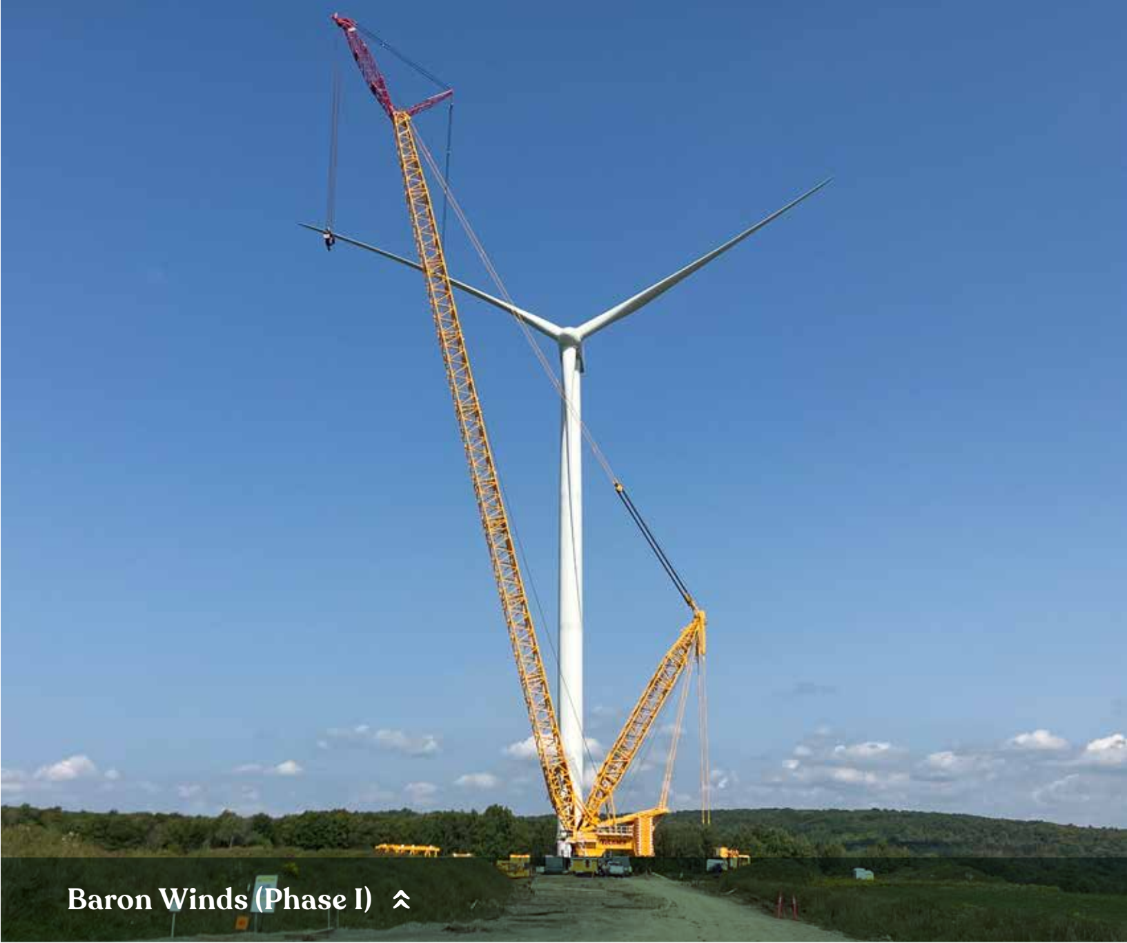
Baron Winds (Phase I) ⤴