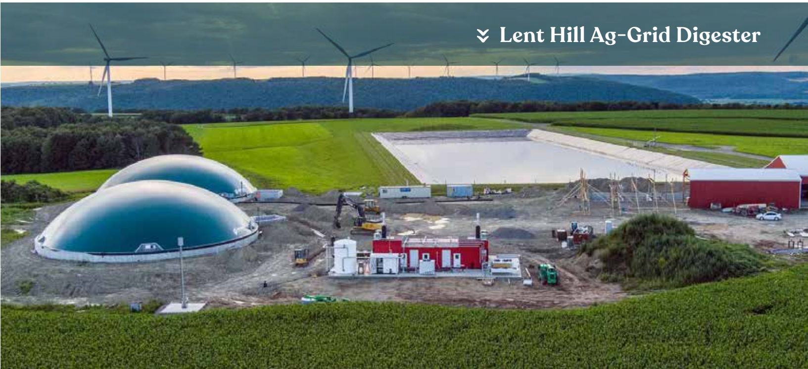
⤵ Lent Hill Ag-Grid Digester