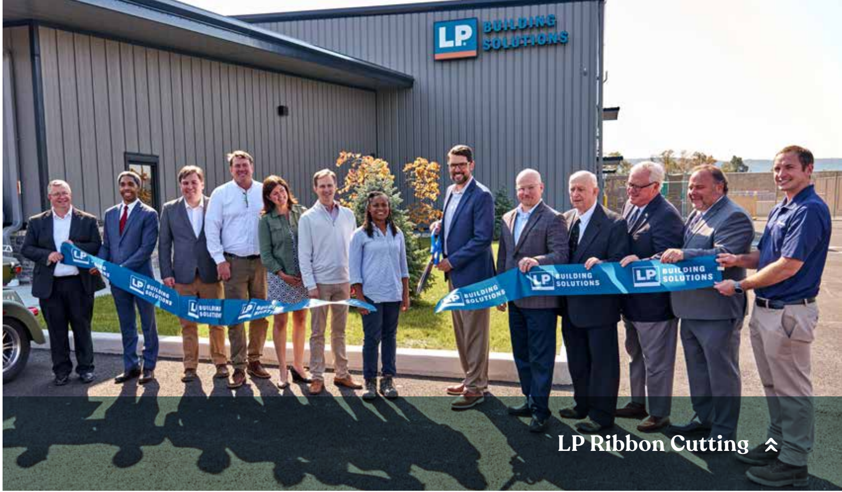
LP Ribbon Cutting ⤴

The project was originally intended to provide homes for sale, however, due to commodity price increases and the economics of the housing market in the city, the sale model did not make sense. To induce this project, the IDA and Riedman structured an incentive that supported a lease model similar to multi-tenant housing projects the IDA has assisted with in the past.