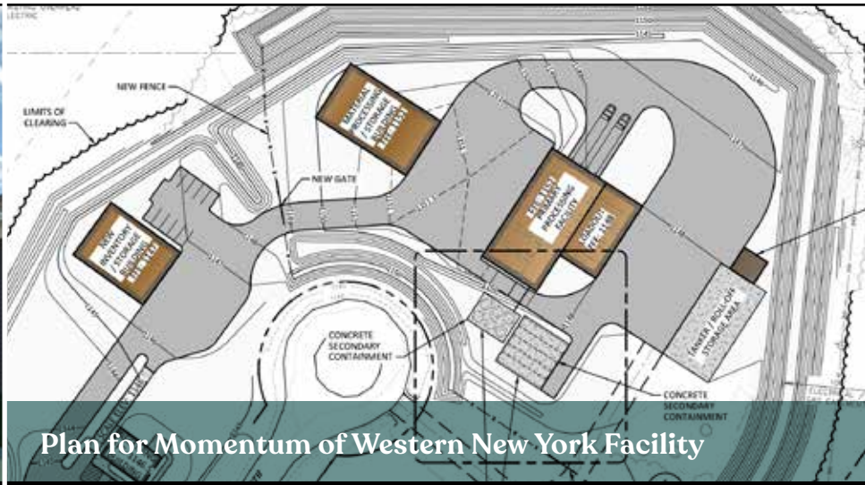
Plan for Momentum of Western New York Facility