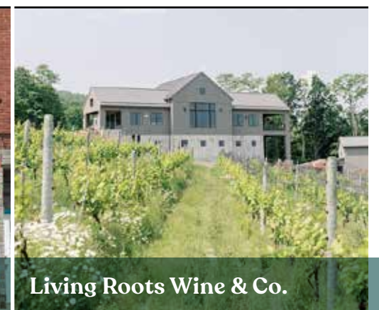
Living Roots Wine & Co.