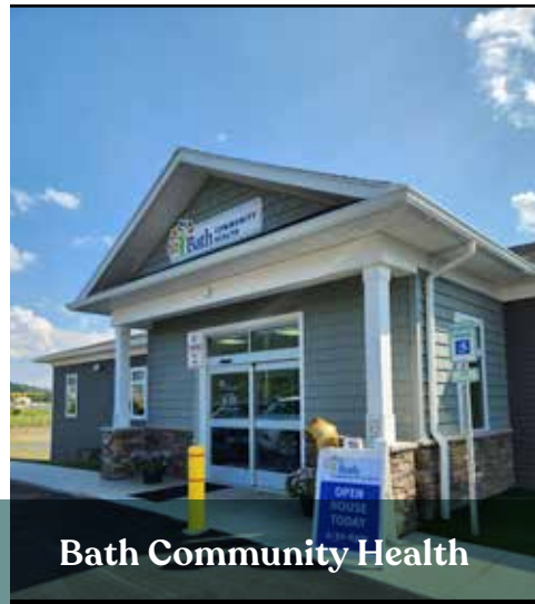
Bath Community Health