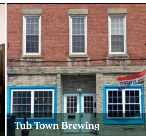
Tub Town Brewing